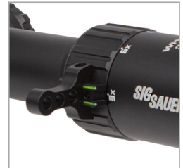
Removable Throw Lever For Quick Magnification Changes