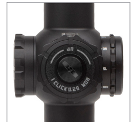
Exposed, Locking, Zero Stop Elevation Dial For Precise Adjustments