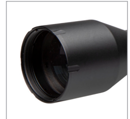
Hdx Optics With Extra-Low Dispersion Glass Provide High Transmittance For Superior Optical Clarity and Light Transmission